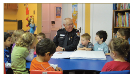
For Canadian Library Month, the Bibliothèque municipale de Gatineau in Quebec partnered with the city's fire department. Firefighters donned their uniforms and read from a giant storybook.