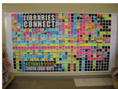
Connecting with Post-it Notes at Strathcona County Library in Sherwood Park, Alberta