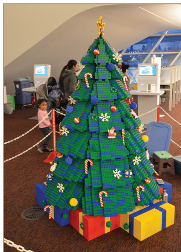
Surrey Public Library won the LEGO/DUPLO contest for BC (their Christmas tree was built with Lego)!