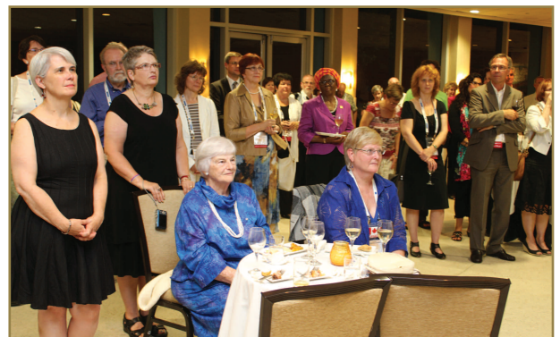
Canadian and international delegates at the reception