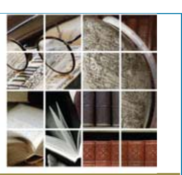
January 31, 2011

CLA will be holding an Open Forum during next week's OLA SuperConference for discussion of the CLA Future Plan. Delegates are