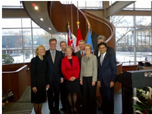
Official Opening Party